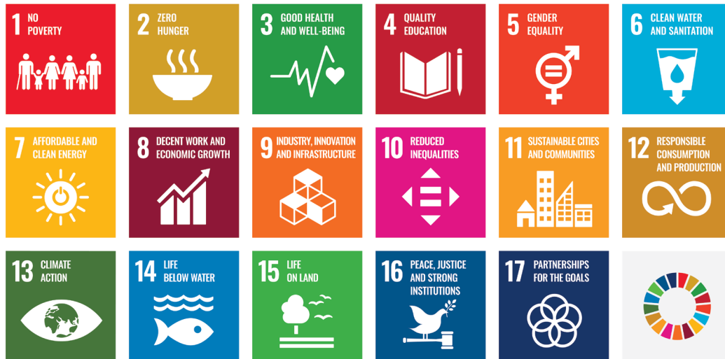
Figure 1: Sustainable Development Goals

The guidance moves the terms of SD and ESD beyond being solely about environmental issues, focusing instead on interconnections and interdependencies between economic, social and environmental factors. ESD is part of an educational change agenda allowing us to look critically at how the world is and to envision how it might be, supporting learners to create and pursue visions of a better world.